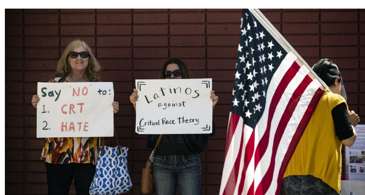
Protesters against CRT in schools