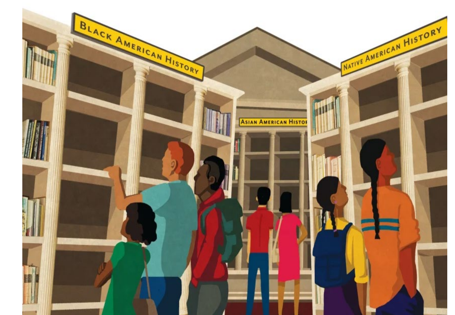
Photo showing students in a library of racial social constructs